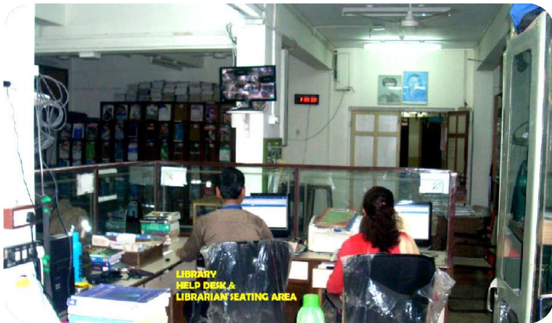
LIBRARY HELP DESK & LIBRARIAN SEATING AREA